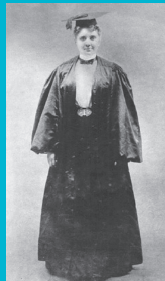
Dr. Ida S. Scudder – a proud graduate of Cornell Medical College (1899)

* http://www.biomedcentral.com/1472-6920/13/3